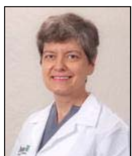
Medicine Doctor for Avera

The hope is that the number of con-Dakota can go another 18 plus years